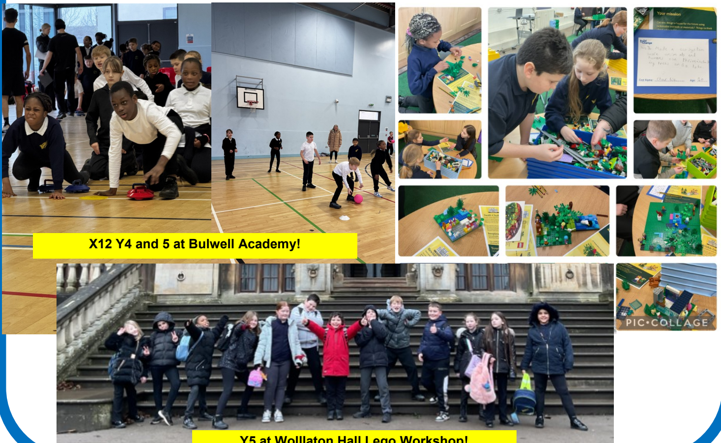
X12 Y4 and 5 at Bulwell Academy!