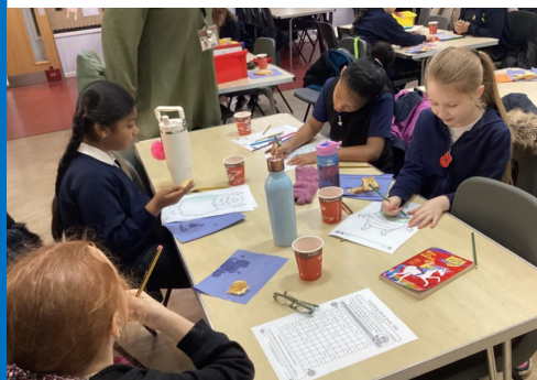
Breakfast Club! Updates to this provision will come out soon!