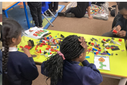
Lego After School Club!